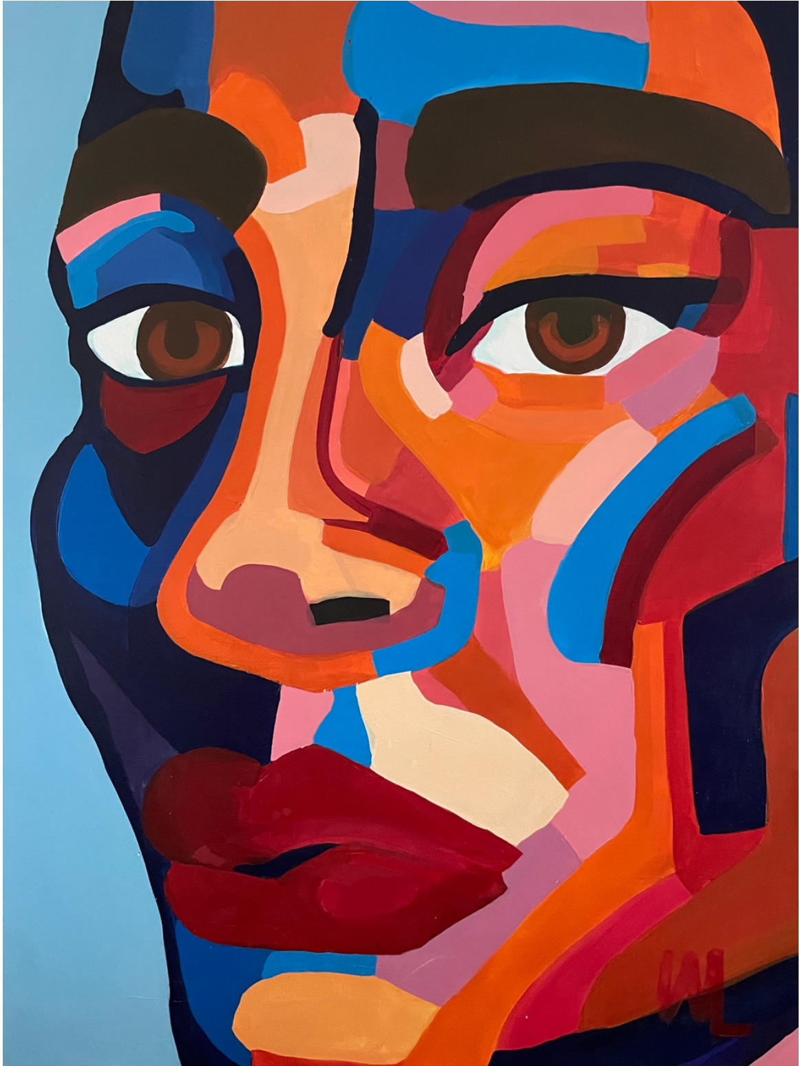
Jorja Oil on Canvas 120 x 90 cm